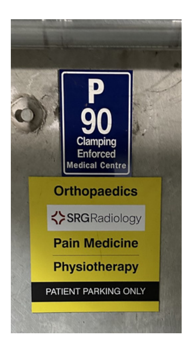
Please park in the carparks labelled "Orthopaedic and Radiology". Parking is FREE.